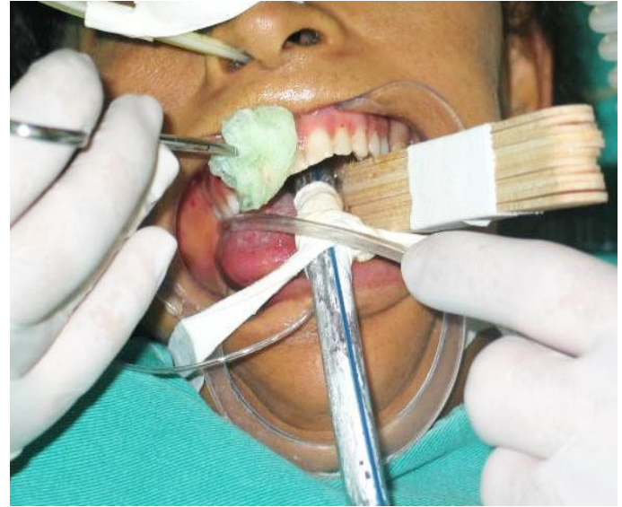
Figure 3. Expander and mouth opener mouth as employees in dental care in the intubated patiente.

It is mandatory to shut down the nasoenteral diet of certain patients. It may be done by the dietician or the nursing staff, because dentistry procedures might make the patient nauseous, especially during tongue and posterior dental region cleaning (Feider et al., 2010; Yusuf, 2013).