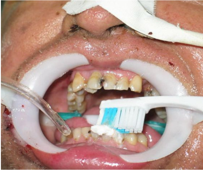
Figure 2. Unsatisfactory condition of the oral cavity, the presence of dental caries in a patient in the ICU.